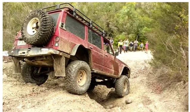
Don't doubt the Trout