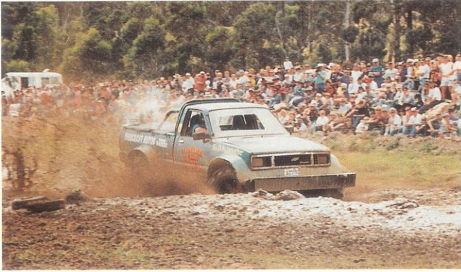
• Tony Streets, called it a day after rolling in his second run.