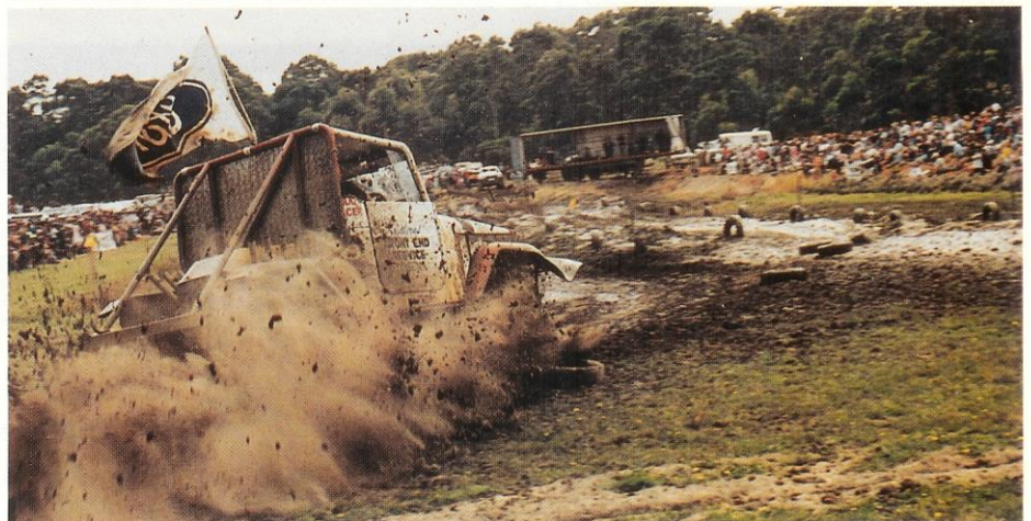
• One of the Mainland entrants, pushing hard gets onto the dry dirt