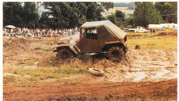
• V8 Landcruiser, trying to hard and going off.