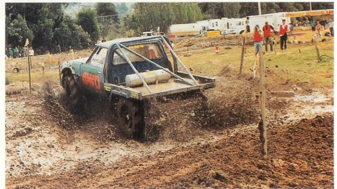
• In it's first outing Armin Baier's car finished 3rd.