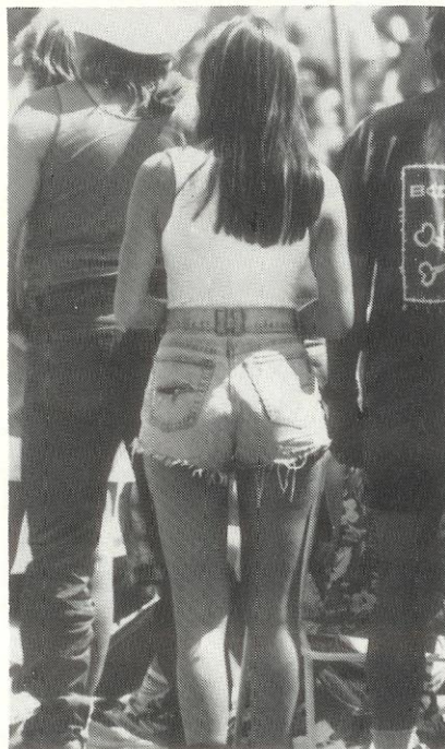
Above: It wasn't just the racing that was 'Hot' at the recent Mud Racing Championships.