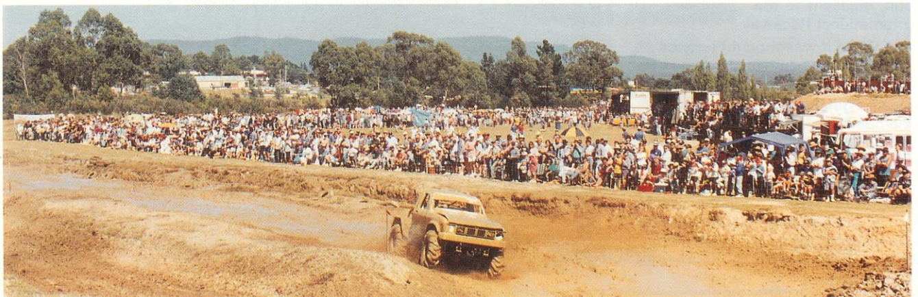
Below: Part of the huge crowd.