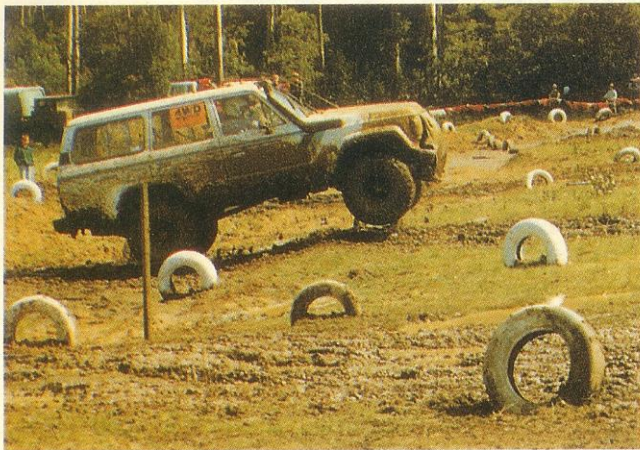
Below Right: Big Ford Utility thunders through the finish line.