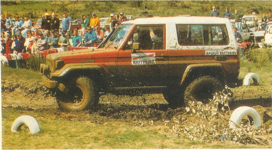
Left: Syd Rogers who came second in the Six Cylinder Class.