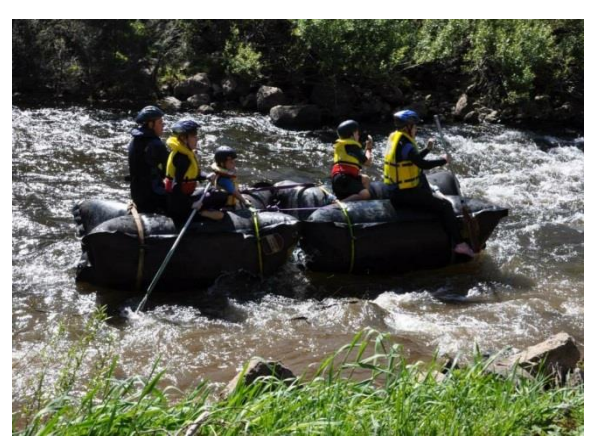
2013 Derby River Derby

Next Meeting Tuesday 3<sup>rd</sup> October 2017 7:30pm @ Clubrooms Sassafras